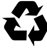
Made from recycled paper